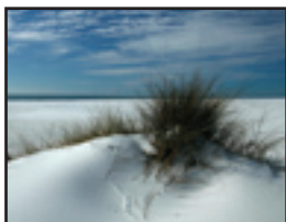
Topsail Preserve State Park found near Timpochee

This trail is a popular path through the Beaches of South Walton. Named after Timpochee Kinnard, the most influential Indian Chief of the Euchee Indians, this paved path parallels Scenic Highway 30-A, surveying the sugar-sand beaches and emerald green waters of the Gulf. The path winds through 7 of 13 distinct beach communities, with unique coastal names such as Dune Allen, Blue Mountain, Grayton Beach, Santa Rosa Beach, Watercolor, Seaside and Water Sound. From migrating flocks of birds to blooming wildflowers and trees, this breezy coastal ride showcases nature's beauty all year long.