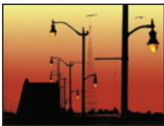
Friendship TrailBridge at Sunset