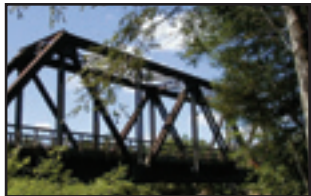
Nature Coast State Trail Railroad Bridge

This paved trail provides an excellent opportunity to experience the Sunshine State's "off the beaten path." The trail consists of two primary alignments built along former rail lines that meet at Wilcox Junction, connecting the communities of Cross City, Trenton, Fanning Springs and Chiefland. A historic train trestle carries the trail