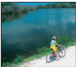
Gasparilla Island - Boca Grande Trail

This first paved rail trail built in Florida runs the length of Gasparilla Island through the town of Boca Grande. The railroad it replaced once brought phosphates from the mainland to the deepwater port on the southern tip of the island. Ride by stately homes, retail shops and swaying palms. The terrain is flat, the vegetation is lush and there's always something interesting to see, such as gopher tortoises crossing the trail. Gasparilla Island State Park, at the southern terminus of the trail, is home to the Boca Grande Lighthouse Museum.