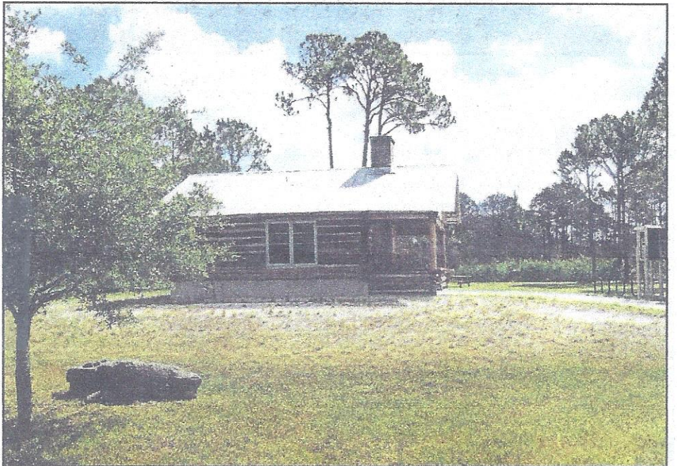
The Turpentine Cabin serves as an information center at the Carlton Reserve.